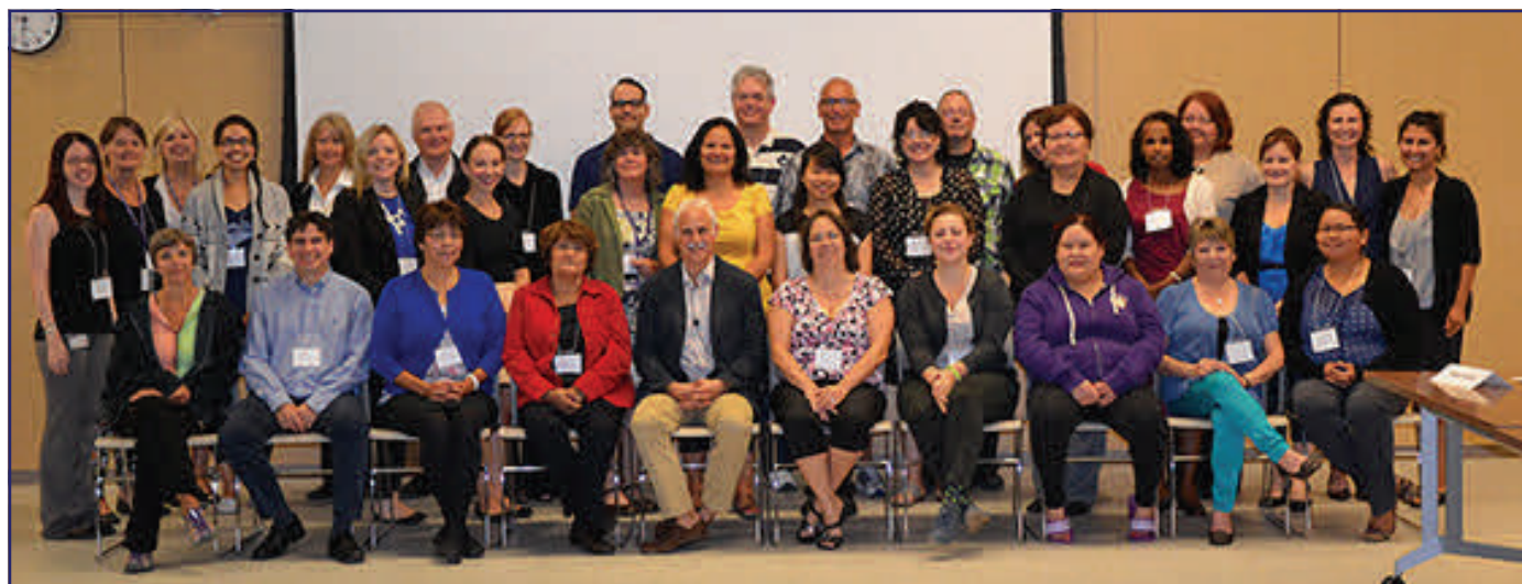
Photograph taken in London, ON at the Steering Committee Meeting on September 10, 2014

Thank you to all those who attended the September 10th Steering Committee Meeting in London. The meeting provided a great opportunity to meet face-to-face with many of our community partners, a few researchers and collaborators. In total, the meeting was attended by 26 team members from coast to coast. The meeting goals of building partnerships and involving the team in discussions and shared decision-making around the feasibility and cultural appropriateness of planned activities and tools, and future funding opportunities were achieved. The meeting began with a review of progress to date and highlighted the readiness tools that have now been developed and are ready for use in our program. Two break-out sessions were held when participants provided expertise and input into either the community-driven quality improvement initiative or the clinical quality improvement initiative. An introduction to the web-based registry and surveillance system was provided and the day ended with individuals sharing their thoughts on the meeting and the program as a whole. The hope placed on the potential for this research program to change diabetes care was articulated and the passion and commitment of everyone in the room was inspirational.